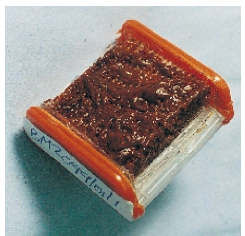
SQ40 after filtration of 2 units of blood

Pall's 40-micron polyester screen is process controlled and monitored to ensure uniformity of pore size. This assures maximum patient protection from microaggregates, clots, and particulate debris from stored or salvaged blood components.